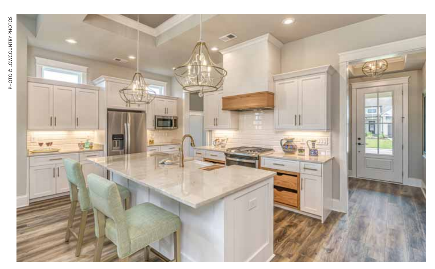
Attractive styling merges with exceptional craftsmanship and state-of-the-art technology. This breathtaking kitchen even features a custom-designed range hood. Visit the Sterling 1 Model, Thistle Estates, Calabash, and see for yourself.