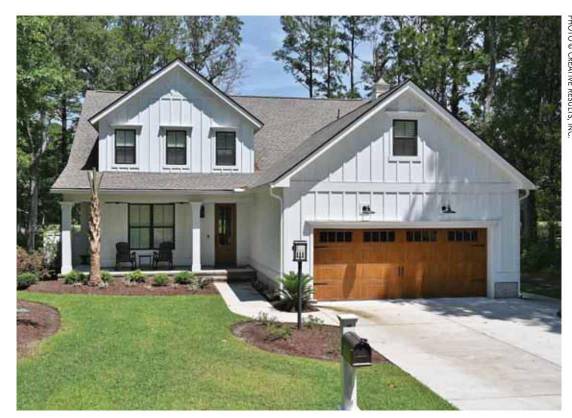
With over 70 years of combined experience in homebuilding, Classic knows the difference is in the details. The signature garage door, matching front door, and porch ceiling fans add to the ambiance of the Bianco home in Pawleys Plantation.

Close attention is paid to time, budget, design, and craftsmanship. Clients expect the best and count on Classic to deliver. Years of experience have increased the team's expertise and capacity to integrate state-ofthe-art systems and value engineering. They have an innate ability to identify both unique and common design