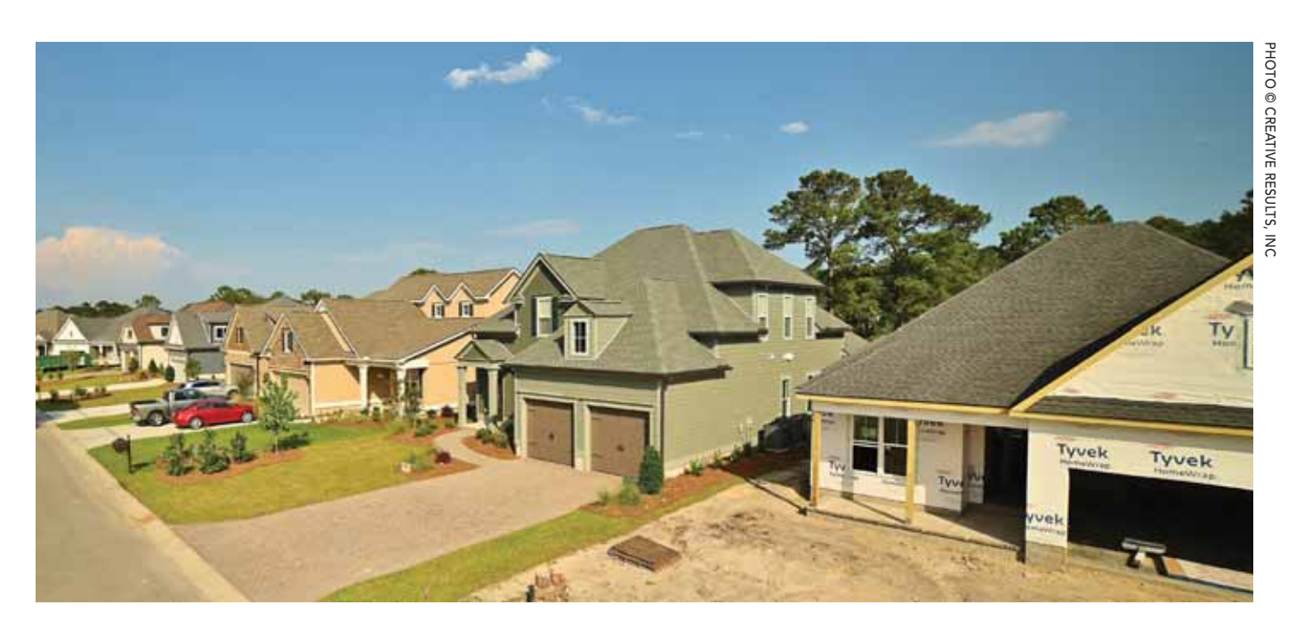
Classic Homes is pleased to be the official builder for Highland Estates in the Thistle, one of Brunswick County's most popular communities. Home to an award-winning golf course and beautiful homes like these, it's no wonder it's turning heads.

that meets the stringent criteria that set the Southern Living Custom Builder apart. This invitation-only program selects custom builders acclaimed for their detailed craftsmanship, excellence in customer service, financial stability, and use of quality building materials. A certified 'green builder,' Classic was the first in South Carolina to build to the 'Fortified for Safer