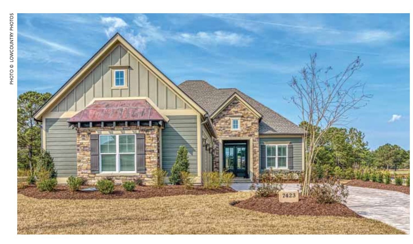
This stunning home is better known as The Inverness. Located in Thistle Golf Estates in Sunset Beach, NC, it is Classic's third Southern Living Showcase Home.