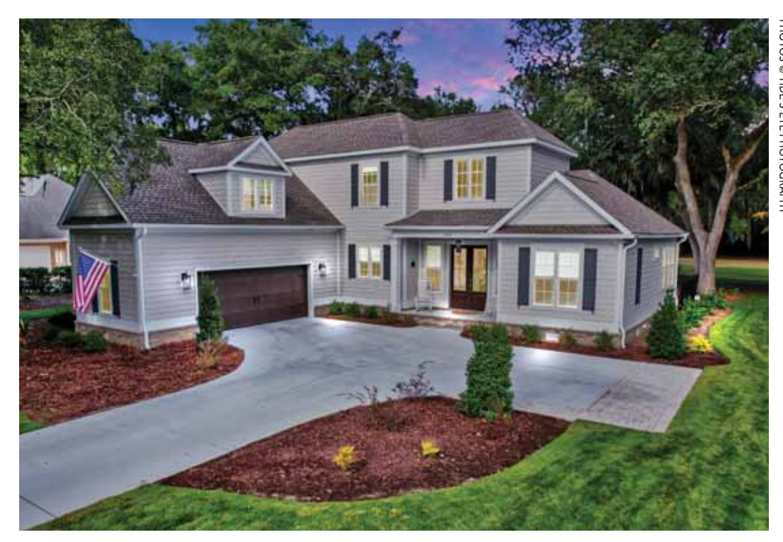
The Puleo's home in Willbrook Plantation stands out against the night sky. Nothing says Lowcountry like attractive accent shutters and of course, rockers on the front porch

Well-known and respected in the building and construction trade, Berkley White is a prestigious master builder who