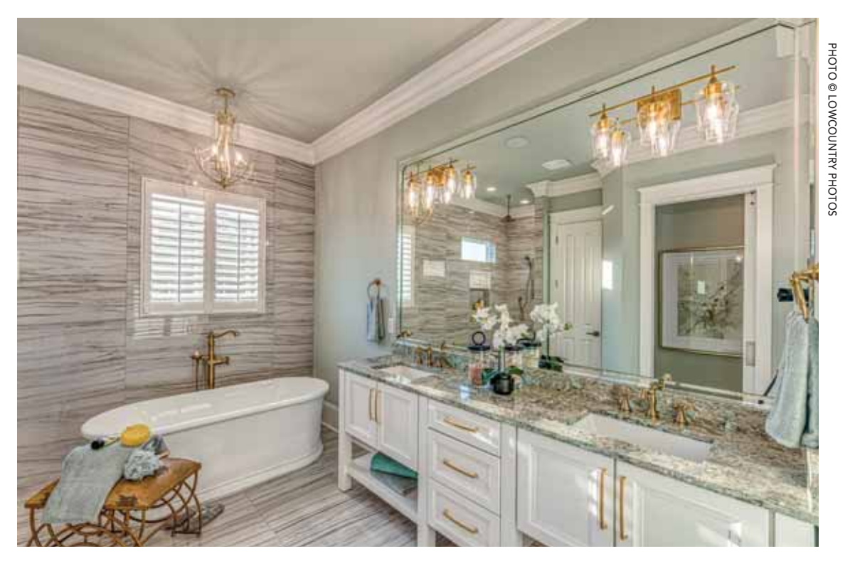
Marble, glass, and gleaming brass add a touch of elegance to this bath featured in the Southern Living Showcase Home. Classic built a masterpiece. Classic Interiors brought it to life with top-of-the-line fixtures and furnishings.

• Model Home Staging --Classic, Coastal, Traditional, Transitional & Beyond