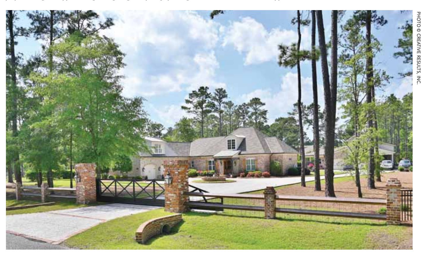
This custom home in Black Creek Plantation has all the extras-plenty of storage, a wine cellar, and, of course, a gourmet kitchen. The homeowner not only loves the design of this gorgeous home but its many outdoor amenities.

24 | Building Industry Synergy | 2023 SUMMER ISSUE 2023 SUMMER ISSUE | Building Industry Synergy | 25