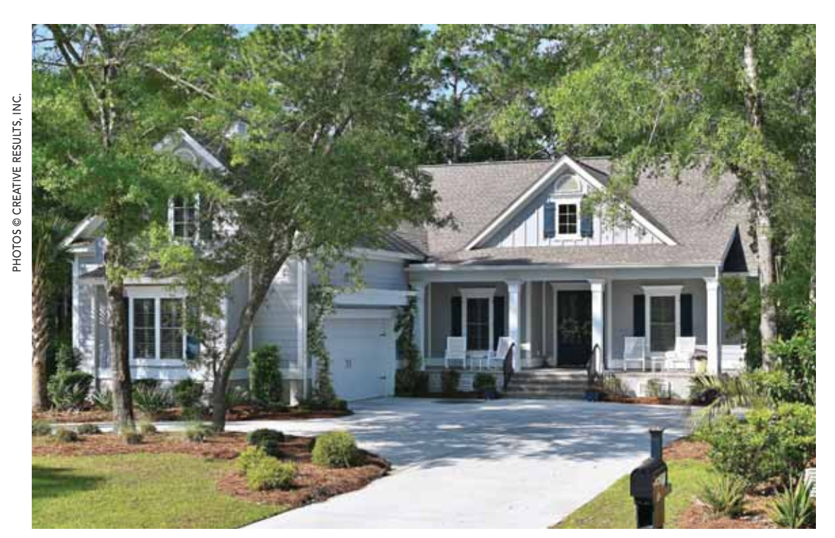
Poised for perfection. The Keyon's home in The Reserve is just what they imagined. It's a breath of fresh airabeautiful home with easy upkeep in a serene environment. Just say, ahh!

Whether the homeowner is local or remote, onsite or virtual meetings are set to review exciting milestones in construction,