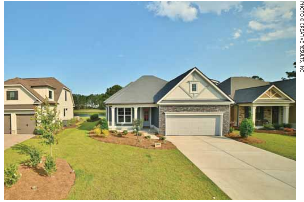
Classic's homes are as unique as the owners. They understand that you want a home that reflects your style and taste. You talk. They listen and build. Classic has built more than 1,000 homes throughout the Carolinas, including these in the Thistle in Brunswick County.

Classic's homes, known for their beauty and durability, are also known for their gourmet kitchens. Ample work space