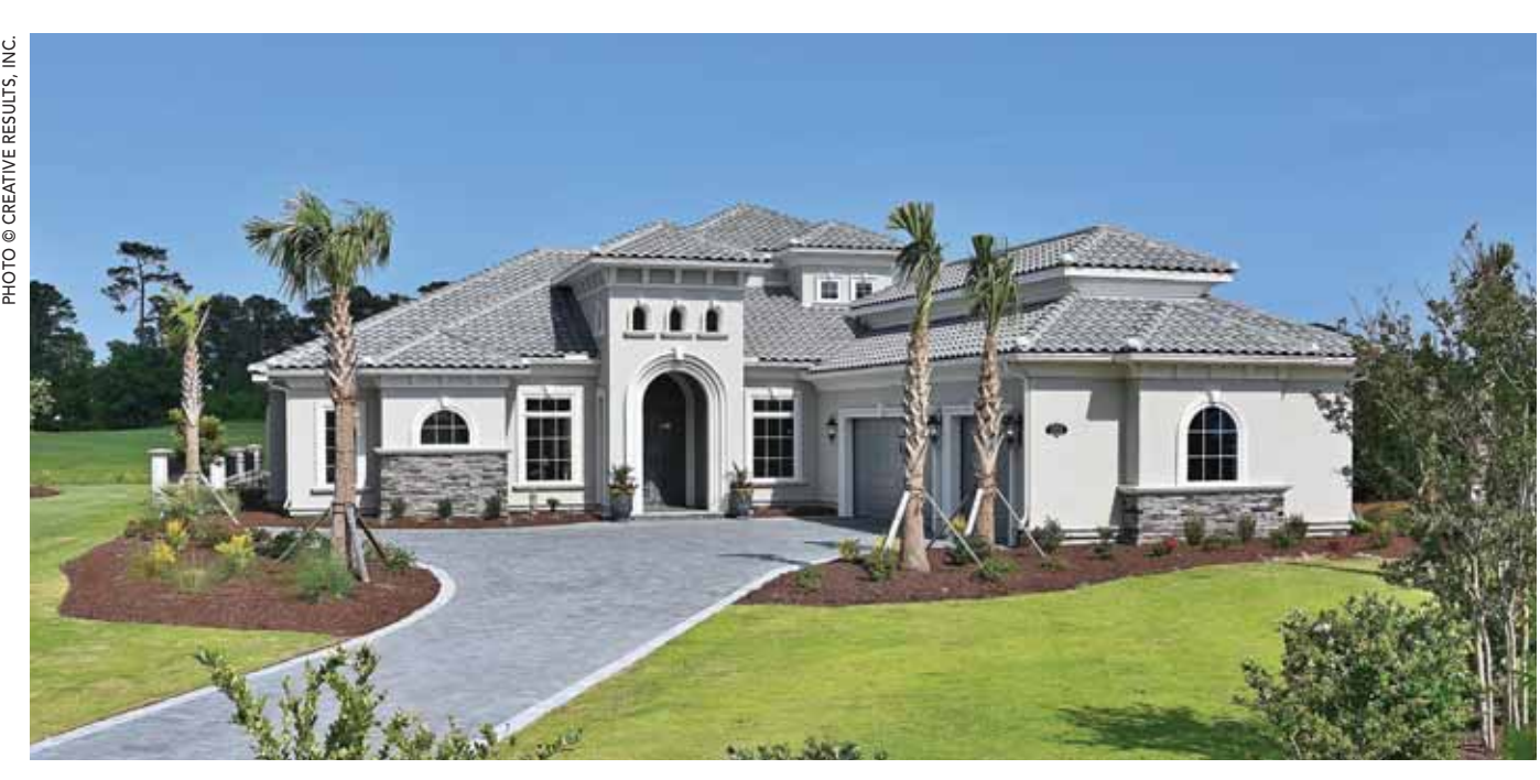
This breathtaking Mediterranean in the Grande Dunes is home to the Stewarts. Its tile roof, custom stonework, and beautifully landscaped yard and driveway make it a sight to behold. Luxuriously designed, it's a Classic!