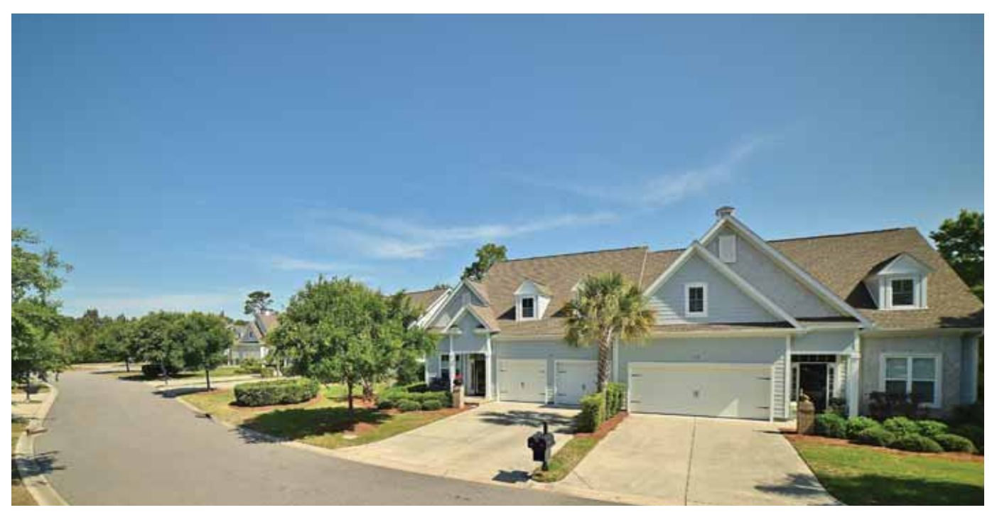
The Reserve Villas at The Reserve offer a variety of home styles to suit every lifestyle. Maintenance-free exteriors and tree-lined streets add to the appeal. Nothing could be finer!

other satisfied homeowners. Classic is so popular that several homeowners have turned to them customer service. for additional builds or remodels. There's no mistaking the power