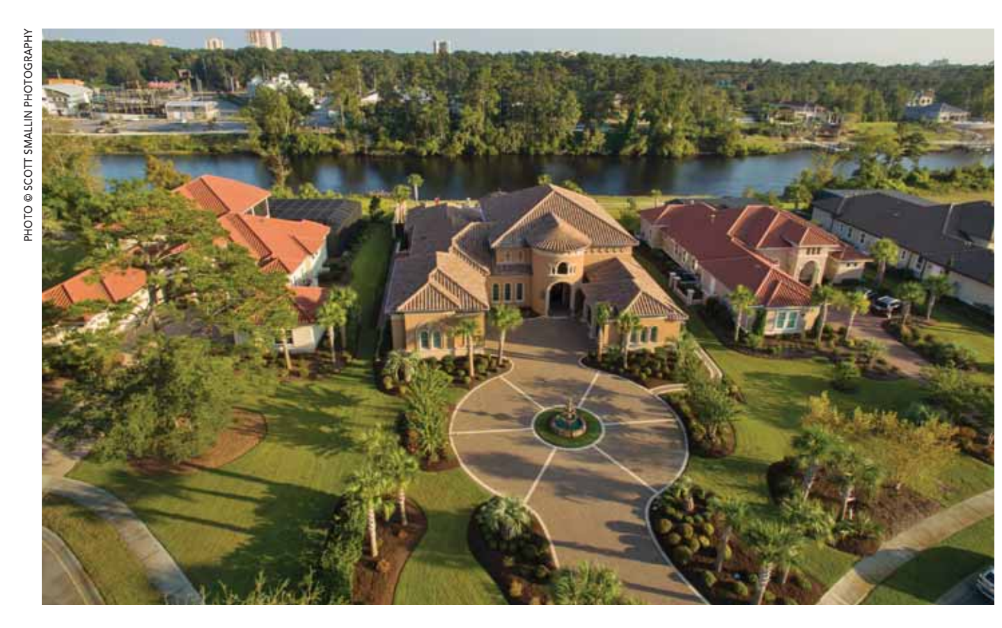
This waterway beauty in the Grande Dunes is home to the Mozingos. Yes, a home built by Classic leaves a lasting impression. Their appreciation for architectural features and desire to turn a homeowner's dream into reality lead to a home that is nothing short of perfection.