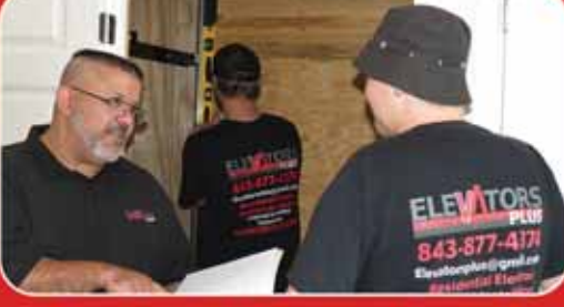
Servicing Horry Georgetown Counties & Surrounding Areas

All Residential Elevators Are Commercial Grade Your Elevator Will Blend Into Your Home Decor With Its Universal Design Capabilities