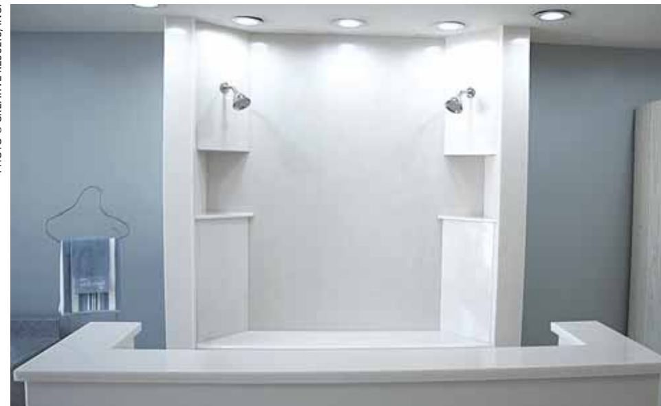
Easton's capabilities are limitless and truly custom. A great example of this is the Shimmering white Eastonite dual entry shower.