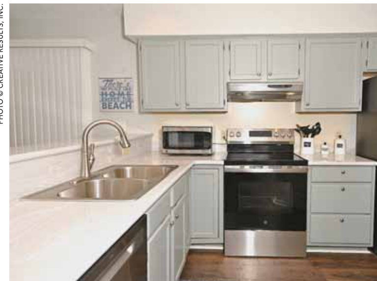
Sterling silver cultured marble kitchen with a bullnose edge.