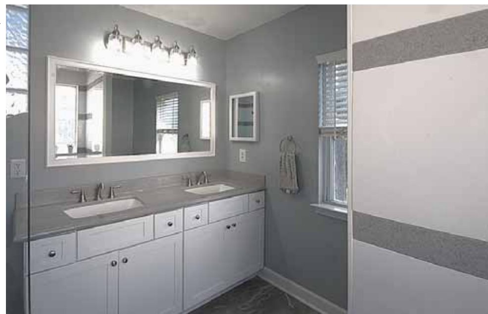
Grey Eastonite vanity top with an integrated white bowl. This is all one piece eliminating any seams.

the perfect fit for my bathroom. They showed up on time, kept a very clean workspace, and delivered the finished products on time as they promised. Also, the pricing and process were clearly explained upfront, and their product is very durable and easy to clean. I have kitchen countertops that they installed in my home 18 years ago and they still look great!"