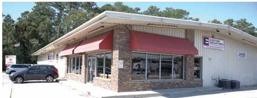
Easton Industries was the third business built on 17 Bypass in 1984. The showroom is located @ 550 Piedmont Ave. in Myrtle Beach ( basically across from Coastal Grand Mall ).