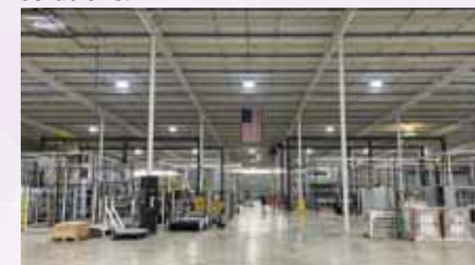
The manufacturing plant in Adairsville, GA

Audacity’s dedication to innovation and sustainability positions these products as game-changers for builders and designers seeking high-performing, aesthetically superior, and environmentally responsible flooring solutions.