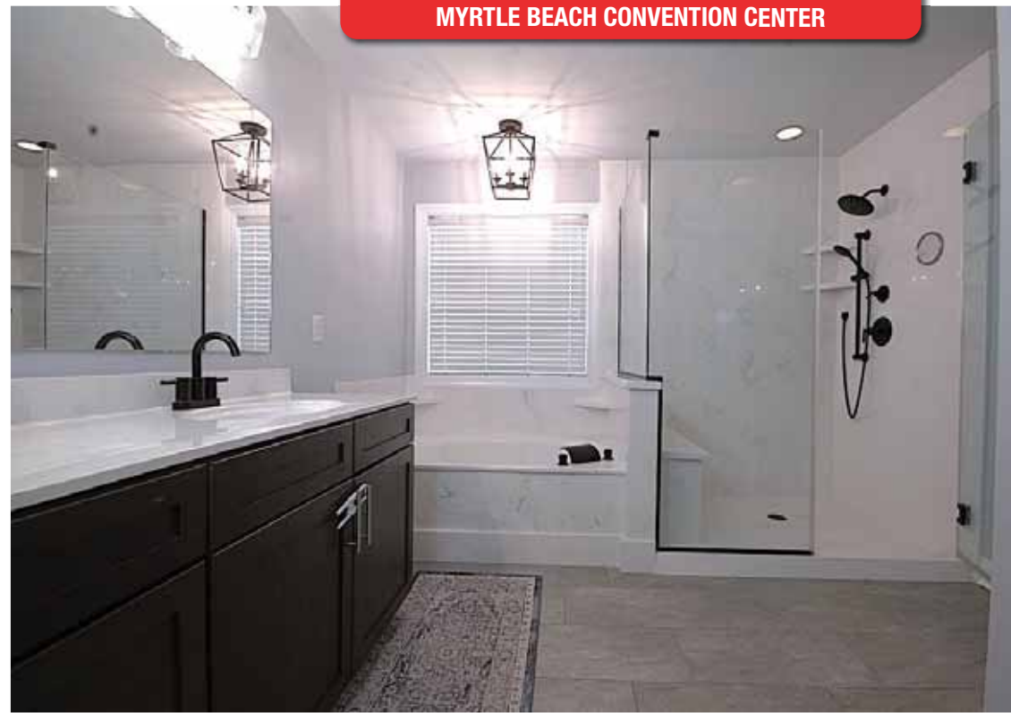
Country Grey cultured marble tub and shower with matte black plumbing and fixtures.

come here recently, but it’s all plastic materials – a lot of stuff that we tear out. ... People always say how great the crew is, how respectful the crew is, and how they clean up after the job, and that goes a long way with customers.”