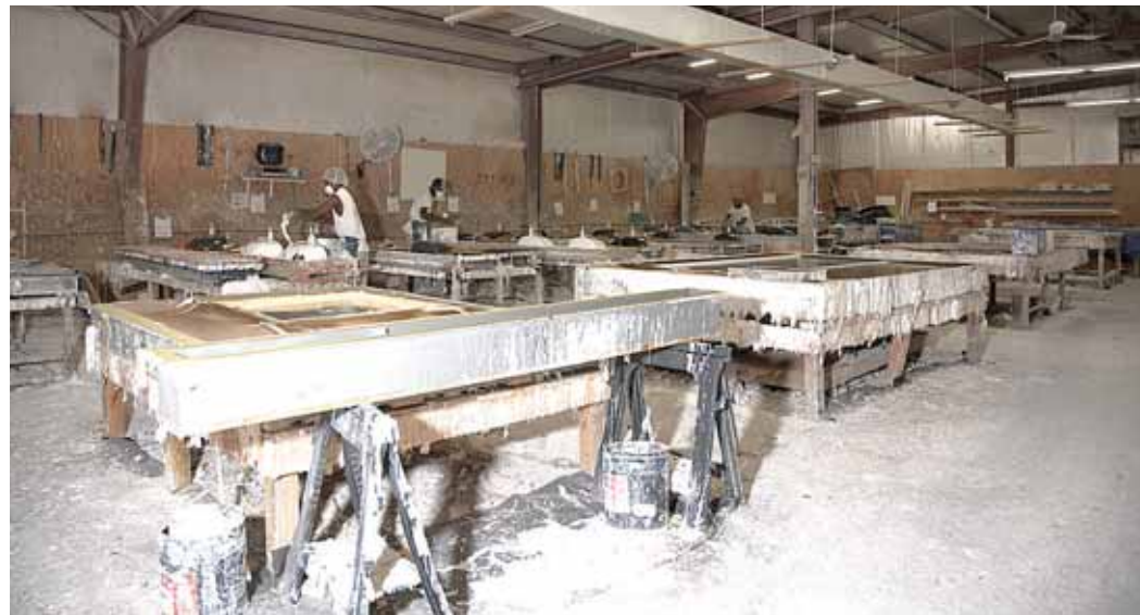
Easton Industries has manufactured cultured marble and Eastonite the same way since 1974. Pouring each custom piece by hand.

“We manufacture everything here at our factory in Myrtle Beach at the same location it’s always been, and then we also install our own product as well,” says Marcis. “It’s all done under one roof. We don’t subcontract anything out from the tear-out phase for a bathroom or kitchen remodel to the install, to the manufacturing of the product. We do it all.”