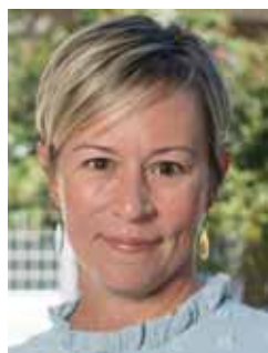
by Ashley Daniels

VISIT THE PROFESSIONALS WITH EASTON INDUSTRIES IN BOOTHS 107 & 108 FEBRUARY 21ST - 23RD IN THE MYRTLE BEACH CONVENTION CENTER