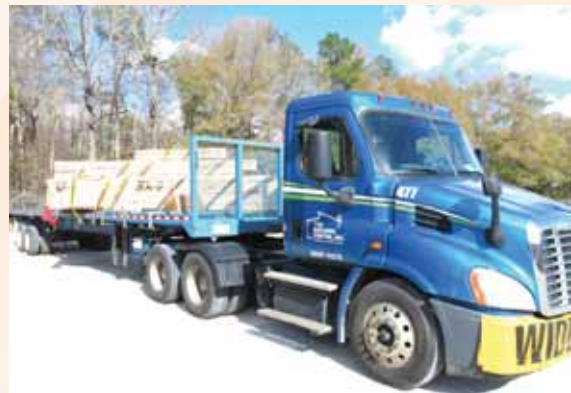
The Building Center located @ 208 Dorien Dr. in Andrews SC, services building professionals from Charleston, SC to Wilmington, NC.

The Building Center, which has been providing quality building products for 48 years, opened the doors of its new location in January 2024. The Georgetown County location serves clients from Charleston to Wilmington, N.C. The Building Center is the 29th largest privately held company in the country and operates 13 locations throughout North and South Carolina. The Building Center's emergence into the area offers builders a more localized option for products and services.