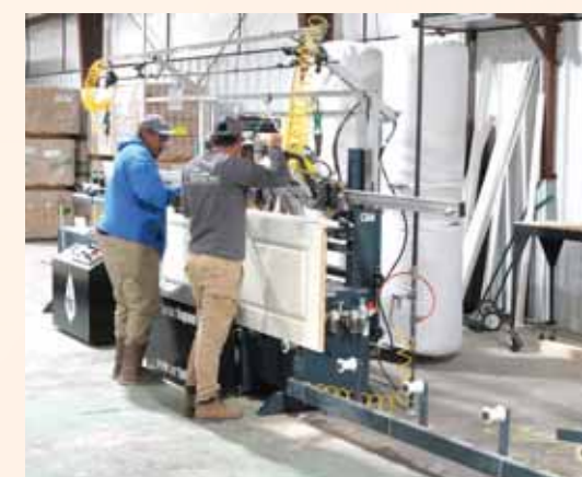
The Building Center manufactures interior doors.

packages. We have purchased a door machine so we can manufacture interior doors."