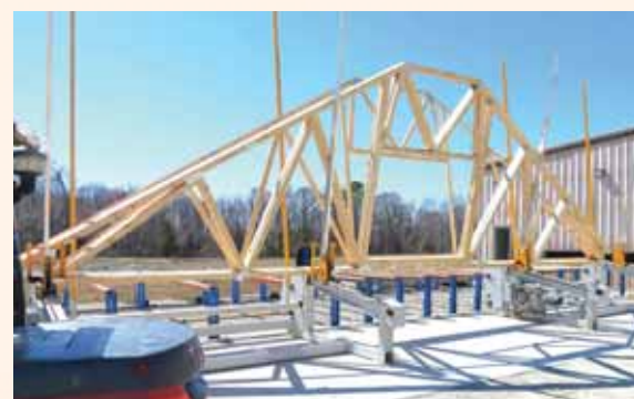
The Building Center designs, manufactures & delivers trusses.

running. We have lumber and building materials on site and are currently shipping framing