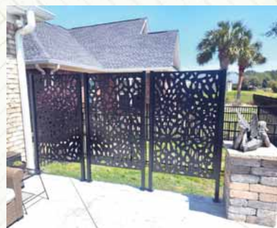
A custom aluminum powder coated black 6' privacy screen manufactured & installed by HDE Building Supply.

For the full gamut of windows and doors, from the traditional to the brand-new, contact HDE Building Supply.