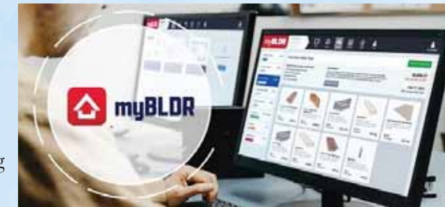
The myBLDR.com platform allows builders to see their builds, their deliveries, their plans & ask for estimates.

In addition, Builders FirstSource offers the myBLDR.com builder platform, featuring cutting-edge digital building industry