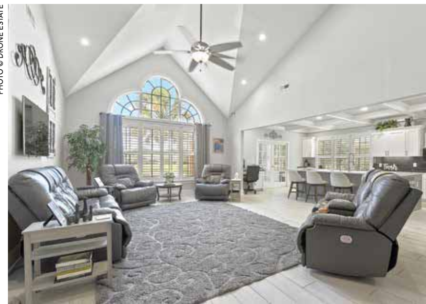
In an effort to create a functional space between the kitchen and living room, walls were removed and load bearing beams were installed to open up the spaces between the adjacent rooms in this full living room remodel. This achieved a cohesive functioning living space perfect for entertaining and family gatherings.

SC Residential Home Builders License # RBB 51453