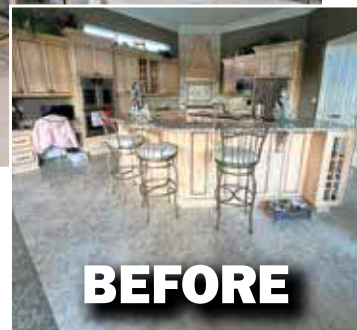
The full kitchen remodel in the Hunt residence encompassed the use of existing and new cabinetry with a custom paint scheme, quartz countertops with waterfall edge detail and a quartz accent wall. Electrical modifications for the undercabinet and recessed lighting, as well as the plumbing modifications for the new island configuration & large format floor tile throughout tied the entire project together.