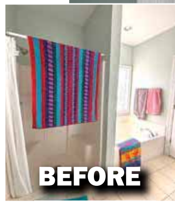
A custom shower in the Miller residence encompassed framing, plumbing, electrical and window modifications to reach the desired layout for a fully custom walk in shower.